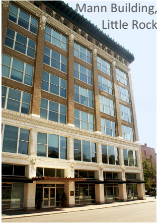
Mann Building, Little Rock