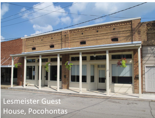
Lesmeister Guest House, Pocahontas

** Arkansas Historic Preservation Program