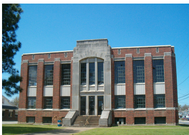
Scott County Courthouse