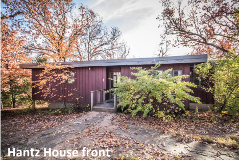
Hantz House front

855 & 857 Fairview St., Fayetteville | Washington Co.