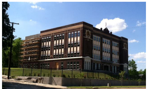
Helena High School Before and during rehabilitation

Helena High School was built in 1912 and the first class graduated in 1913. The old school building is one of the most monumental and lavishly detailed early neo-Classicism buildings in Helena. After the building was vacated in 1972 and used for storage for several years, it was abandoned, becoming the victim of deterioration and vandalism. The old school is finally getting a new lease on life with a rehabilitation project well under way to adapt the building for use as affordable senior housing.