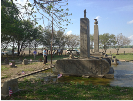
Monuments at Rohwer NHL