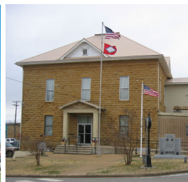
Searcy County Courthouse

With the nomination of historic county courthouses to the Most Endangered Places in 2012, the Historic Preservation Alliance of Arkansas set out to advocate for increased funding for the County Courthouse Subgrant program by raising awareness of the lack of adequate funding for historic courthouses and mobilizing county officials and other stakeholders. Thanks to the outreach by many county judges and others familiar with the challenges facing historic courthouses, and to the attention that the courthouses received from the Most Endangered listing, the ANCR and Department of Arkansas Heritage allocated $1.2 Million for county courthouses in FY2013 and $1.399 Million for FY2014.