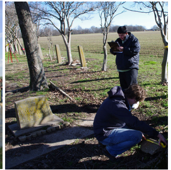
UA Student HALS Project

nearly 8,500 people at its peak population. The Jerome Relocation Center operated from October 1942 to June 1944 and held over 7,900 people at one time.