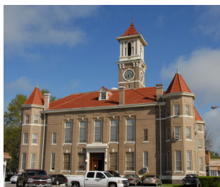
Monroe County Courthouse