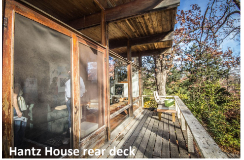
Hantz House rear deck

Along the winding Fairview Street in Fayetteville, the Hantz House and the adjacent Durst House form a distinctive unit of Mid-Century Modern residences that represent the important legacies of significant figures in art and architecture in Arkansas whose contributions also helped shape the University of Arkansas. These modest scaled houses also stand out as fine examples of the adaptation of high style Modern architecture to the distinctive terrain of the Arkansas Ozarks.