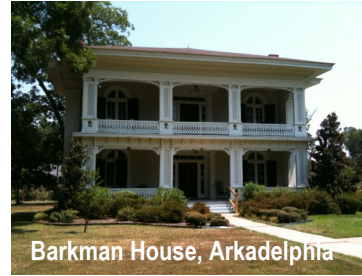
Barkman House, Arkadelphia

Enjoy lunch with the Clark County Historical Association on the grounds of the James E.M. Barkman House (c.1860), an interesting building combining the Greek Revival and Gothic Revival architectural styles. Ramblers will hear about Clark County's role in the Civil War.