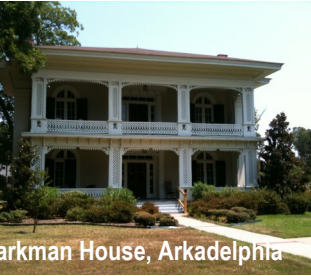
Barkman House, Arkadelphia