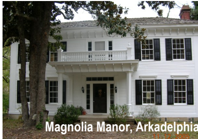
Magnolia Manor, Arkadelphia

Once on the Alliance's Most Endangered Places List, Magnolia Manor (1857) has been lovingly rehabilitated. Ramblers will tour the house with the owners and see documents related to the building's Civil War history.