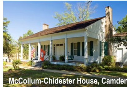
McCollum-Chidester House, Camden

Tour a the Greek Revival home built in 1847, which served as a stop on the Butterfield Trail and as Civil War headquarters for Union General Frederick Steele during the Red River Campaign of 1864.