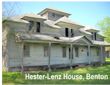
Hester-Lenz House, Benton

Enjoy lunch with the Clark County Historical Association on the grounds of the James E.M. Barkman House (c.1860), an interesting building combining the Greek Revival and Gothic Revival architectural styles. Ramblers will hear about Clark County's role in the Civil War.