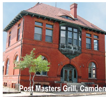
Post Masters Grill, Camden