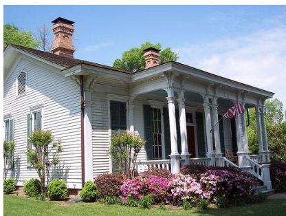
Old Hotze House, Little Rock

Other properties formerly listed on the Most Endangered Historic Places list include the Mitchell-East Building in Tyronza, which now houses the Southern Tenant Farmers Museum; the Rosenwald School in Selma which received a grant from Lowe's and the National Trust for Historic Preservation for restoration as a community center; and the Stephen H. Chism House in Logan County which is currently being restored by the owner.