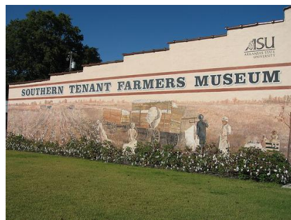
Southern Tenant Farmers Museum, Tyronza