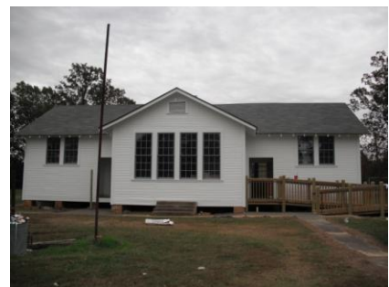
Selma Rosenwald School